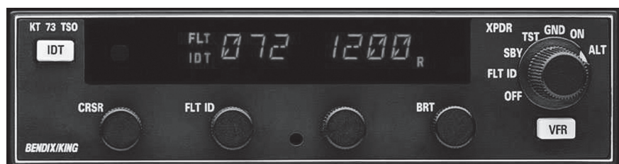
Bendix/King KT 73 Transponder

interrogated in Mode C it is asked for altitude. Modes B and D are not used. The civil Mode A coincides with the military Mode 3. That is why Mode A is often called Mode 3/A. The replies are called Codes. The Mode A Code is set in the cockpit in four digits, the Mode C Code automatically transmits the altitude, with 1013.2 hPa as the reference pressure, just like in Flight Levels. Coupling a dedicated Mode A Code to a flight plan allows the ATC controller to see the Aircraft Identification (ID) of a particular aircraft directly on his screen. Mode C does the same with the addition of altitude. To-