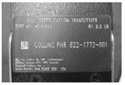
Rockwell Collins HST-900 High Speed Transceiver

INMARSAT Swift64 is nothing more than the "tube" that connects the aircraft HSD to the satellite and operators must subscribe for service through a service provider. The service providers act like a phone company or Internet Service Providers (ISP) on the ground, providing connectivity, billing and other related services just like your home service. Currently, there are two types of data service-Mobile Euro-ISDN and Internet Protocol (IP), which is based on Mobile Packet Data Service (MPDS)-globally available to aircraft in flight. The Euro-ISDN is a high performance connection that charges per minute of connectivity, while the MPDS version charges customers for only the data used, it is tab-